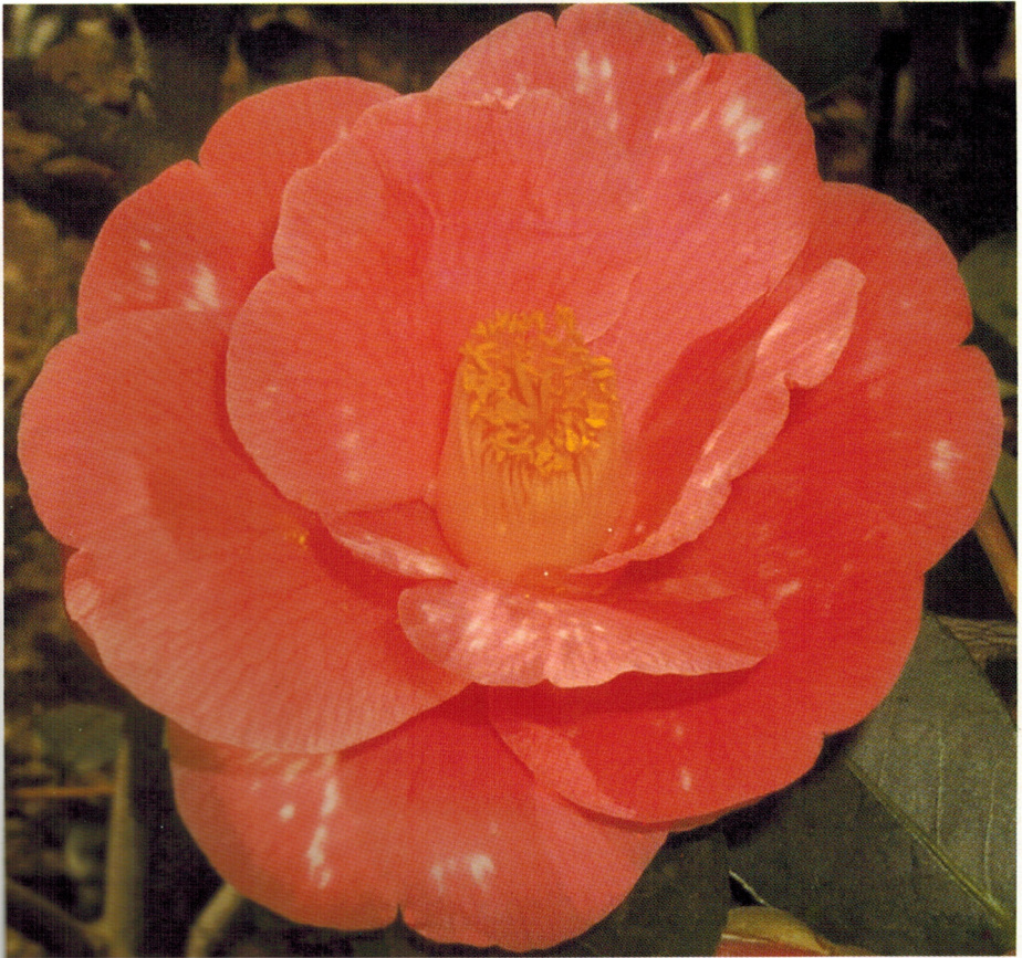
Non-Reticulata Hybrid 'Waltz Time'

A Publication of the Southern California Camellia Society