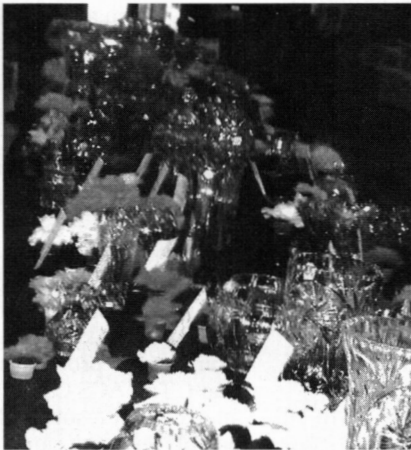
Pretty flowers all in a row.